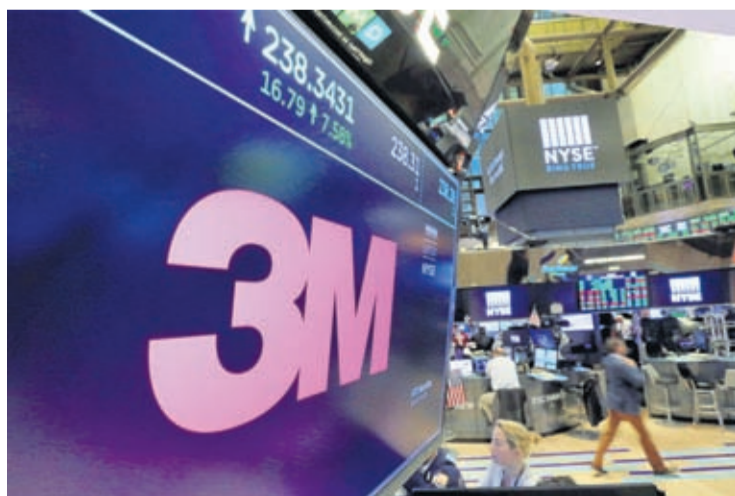
The logo for chemical and consumer products maker 3M appears on a screen above the trading floor of the New York Stock Exchange on Oct. 24, 2017.

PFAS manufacturing and “work to discontinue use of PFAS” in all its products by the end of 2025. 3M makes a broad range of consumer products, including Post-it notes, Scotch Brite cleaning supplies, adhesives and personal protective equipment. Chemical and other industrial companies have been sued frequently in recent years for downplaying the dangers of the chemicals. In a November lawsuit, the state of California accused 3M, Dupont and 16 smaller companies of covering up the harm caused to the environment and the public from chemicals manufactured by the firms that have over decades found their way into waterways and human bloodstreams. □